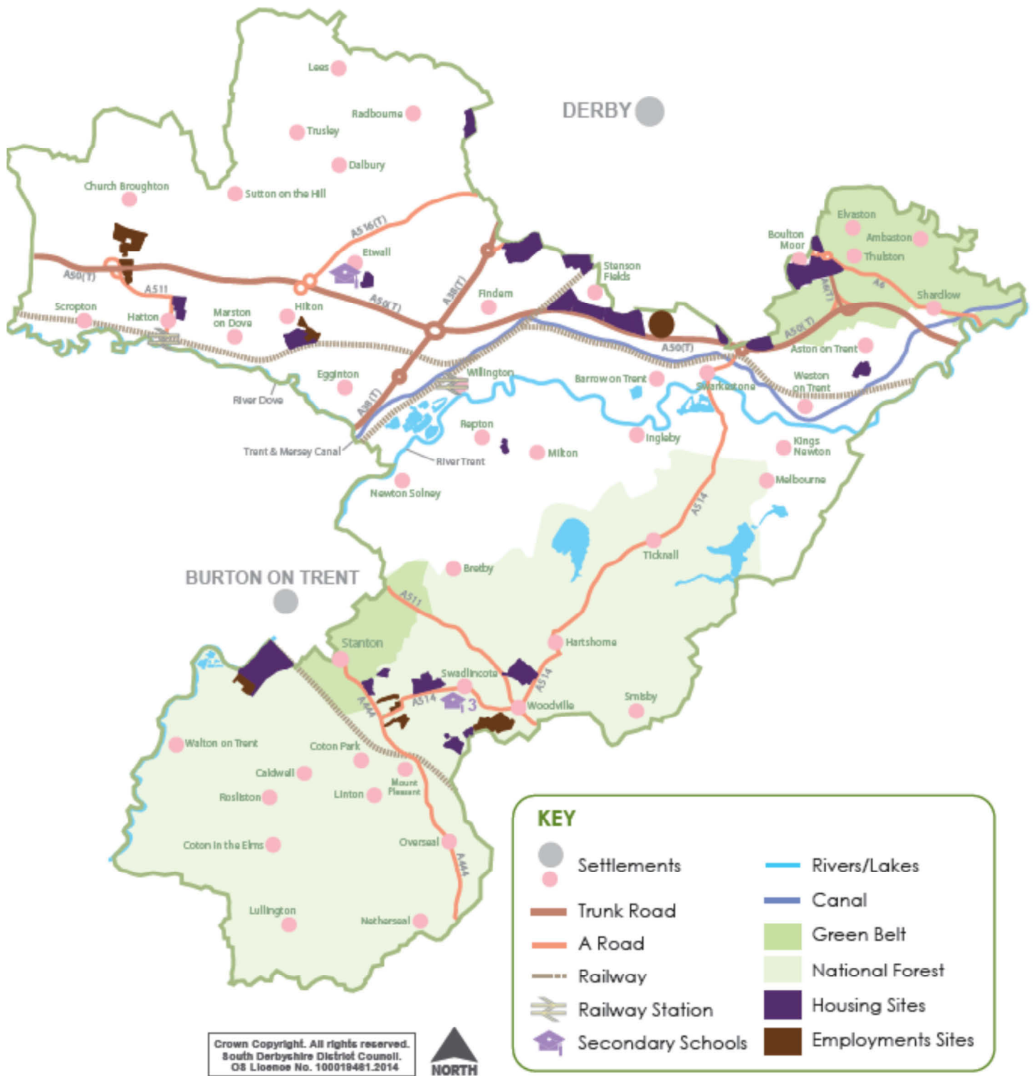
Figure1: Key Diagram – South Derbyshire District