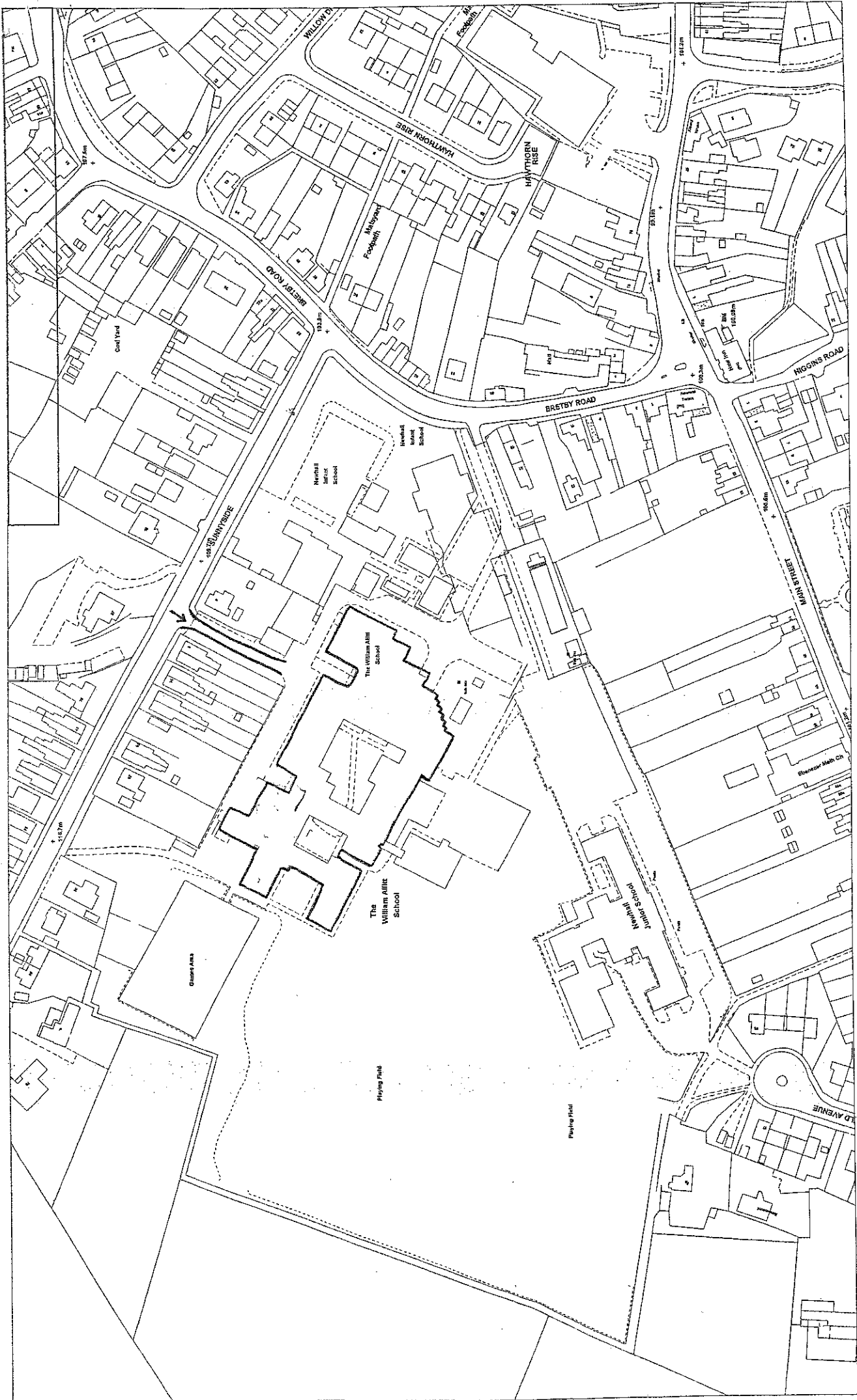
South Derbyshire District Council. O.S. Copyright Licence LA 079375. Based upon Ordnance Survey Mapping with the permission of the Controller of Her Majesty's Stationary Office Crown Copyright. Unauthorised reproduction infringes Crown Copyright and may lead to Prosecution or Civil Proceedings.