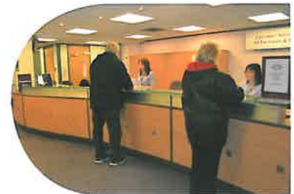
Greater privacy at Customer Services