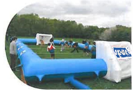
Human football gets results