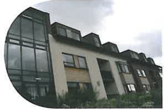
The innovative award-winning Oakland Village