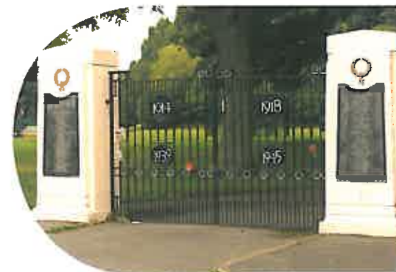
The War Memorial at Eureka Park