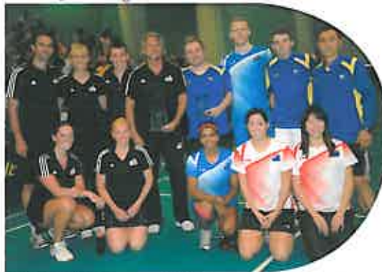
Etwell Leisure Centre, the base camp for the Australian and Canadian Olympic teams