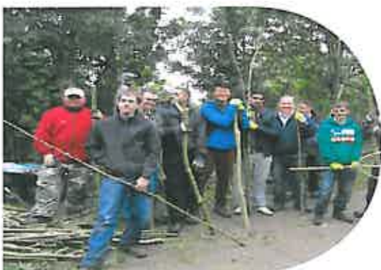
Rolls-Royce staff dedicated to environmental projects