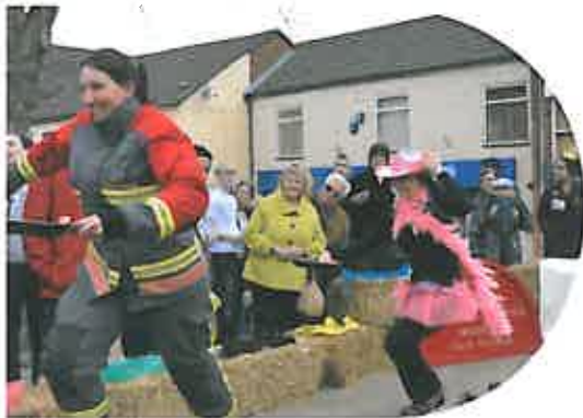
Serious competition at the Pancake Race