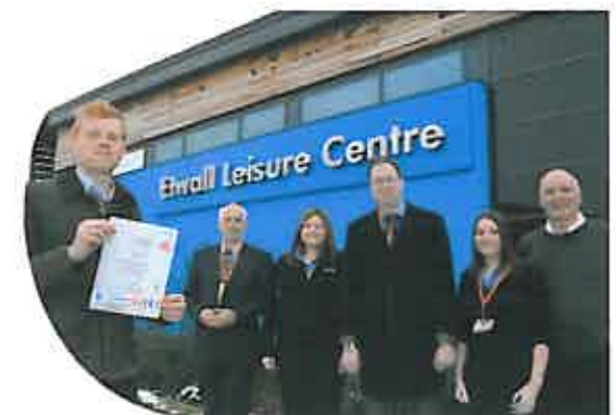
Beating international environmental standards