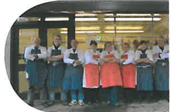
Colliers Butchers, one of the traditional family shops on Swadlincote High Street