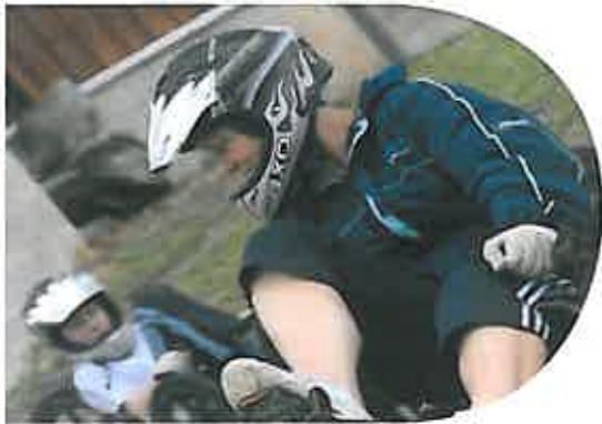
KMX, the new sport that combines karts and bikes