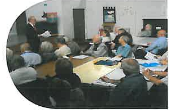
Finding out more at the Tenants' and Residents' Forum