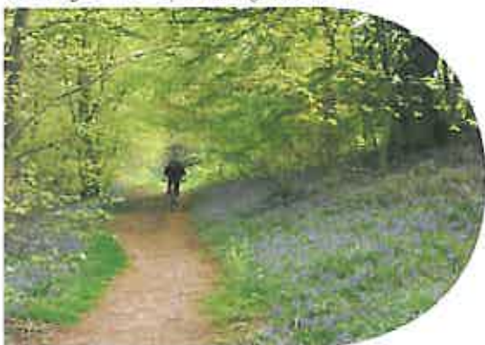
"There is a silent eloquence in every wild bluebell". Anne Bronte