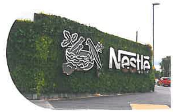
Nestlé (UK) is investing £310,000,000 at Hatton