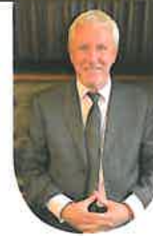
Chief Executive South Derbyshire District Council