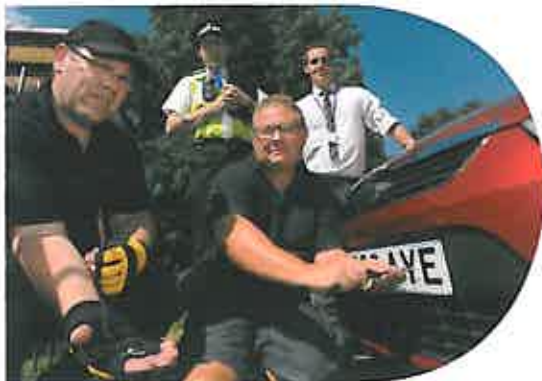
Driving down crime