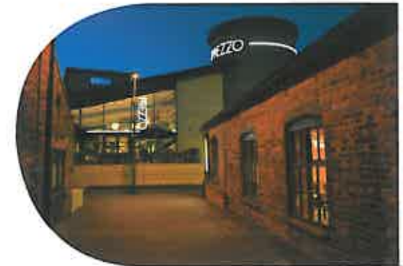
The Pipeworks, adding to the evening economy in South Derbyshire