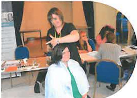
Hands on experience at the Careers Fair