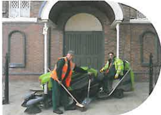
A clean sweep in the value for money stakes for the Cleansing team