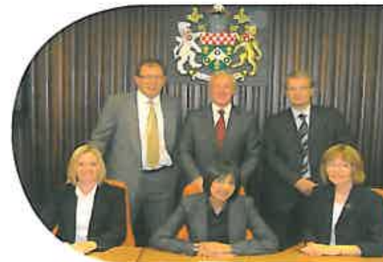
South Derbyshire's legal experts and Law:Public

The Out and Active and the Schools' Enrichment Programmes have enabled young people to try a host of activities such as climbing, mountain biking and archery. Its Brighter Biking scheme provided funding for young people's high visibility packs.