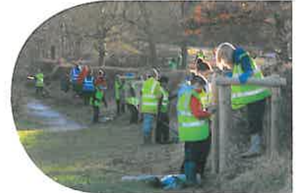
The community adding to The National Forest