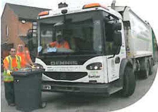
The Waste team. Have proved that they do not waste money