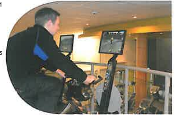
State of the art gym equipment at Green Bank Leisure Centre

Working with the trustees, South Derbyshire District Council has spent £550,000 to upgrade the bowling green, bowls pavilion and car parking at Gresley Old Hall.