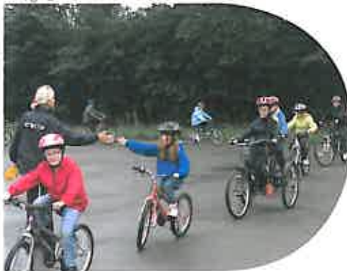
Improving cyclists' safety at Bikeability