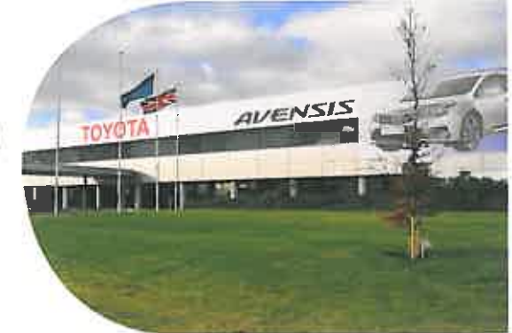
Burnaston, home of Toyota UK's new Auris