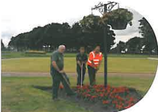
The value for money Grounds Maintenance team

The Council recognises that there are areas of service which can be further improved. It welcomes feedback from its customers through its website www.south-derbys.gov.uk , or by email customer.services@south-derbys.gov.uk , or by post at the Civic Offices, Civic Way, Swadincote DE11 0AH or by phone 01283 221000.