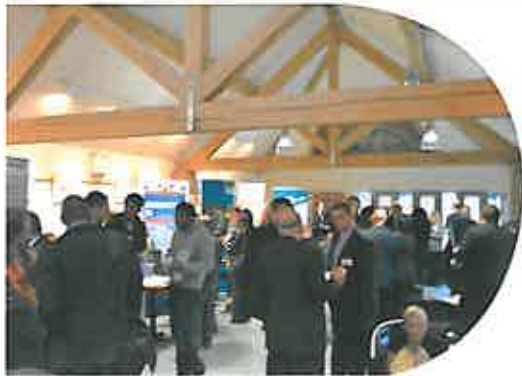
Networking at a business breakfast