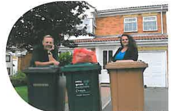
The new easy, green recycling scheme