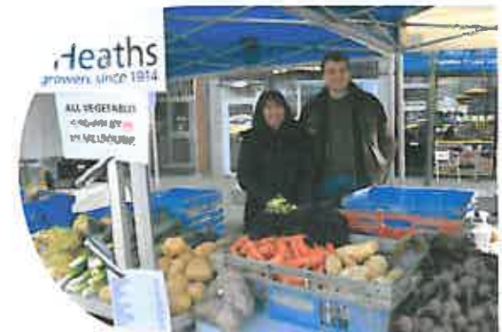
Local produce at Swadlincote's award-winning market

If every household recycled just one catalogue or phone book, we could stop more than 600 tonnes going to landfill each year.