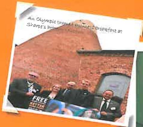
Striking up the Olympic Legacy in South Derbyshire even before the start of The Games with Olympic Mascot Wenlock