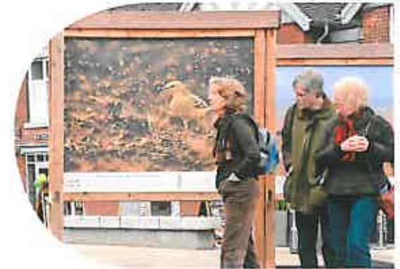
2020VISION, a night and day gallery on The Delph Copyright 2020VISION

South Derbyshire beat all national and international standards by having low nitrogen dioxide levels on its busiest roads.