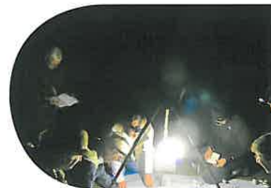
An enlightening environmental evening at Night World