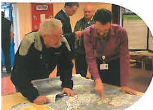
Involving local people in the Local Plan