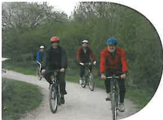
Happily on their bikes