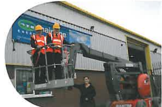
Rising opportunities with one to one business advisers