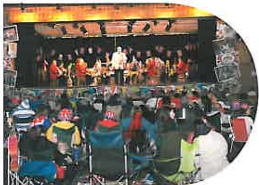
Jubilee joy at the Last Night of the Proms at The Glade in The Forest at Rosliston Forestry Centre