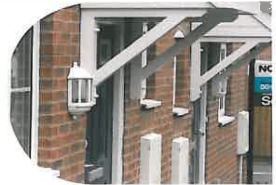
More affordable homes in South Derbyshire

The Council's Careline service moved to Oakland Village, as it continued to provide support services so that vulnerable people could remain independent, while their families were reassured that help was only a call away.