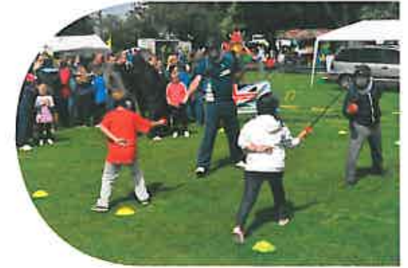
Touché - young people enjoying a new sport