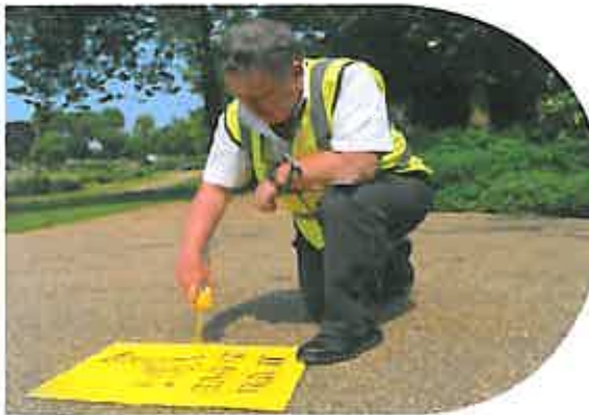
Making sure some dog owners get the message