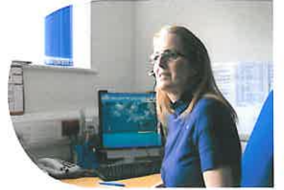
Careline support, only a call away