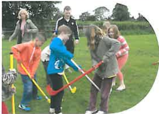
Even jollier hockey sticks