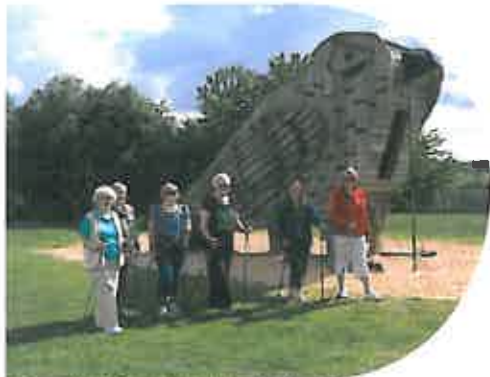
Power polewalking at Haslston Forestry Centre