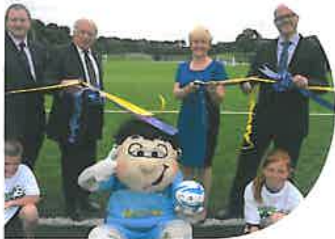
New generation artificial pitch at Etwell Leisure Centre